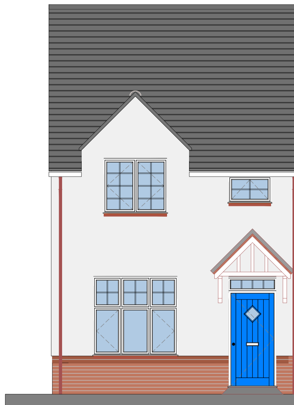
Front Elevation Render