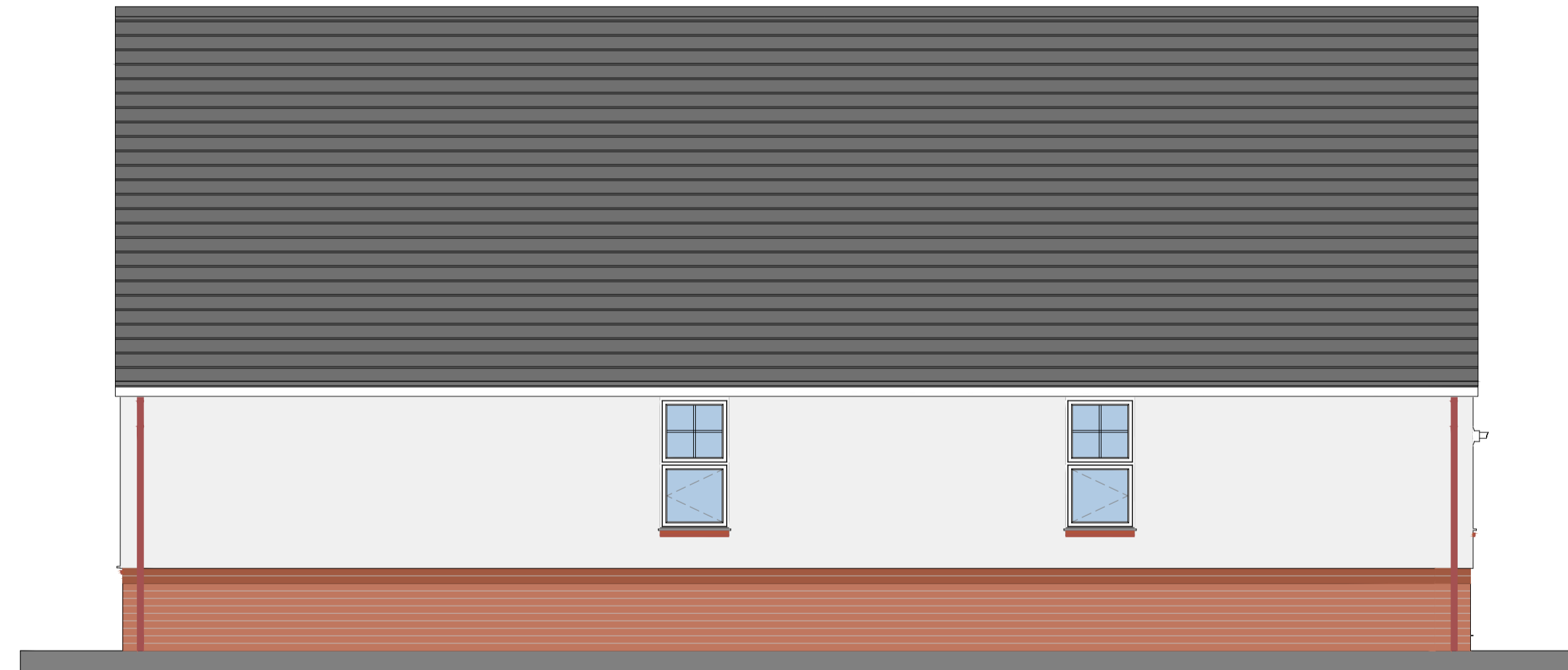
Side Elevation R