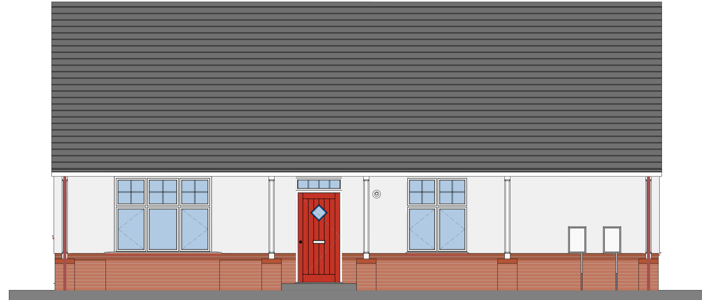
Side Elevation L