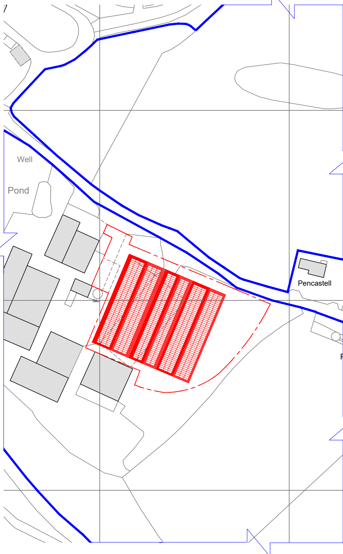
SITE LOCATION PLAN - 1 : 1250 Scale PLAN LLEOLIAD (Cyfeirnod Grid SN62623 74498) Ordnance Survey Copyright Licenced to IAGO Cymru Ltd Licence number 100039911

During reproduction Drawing may Shrink or Expand