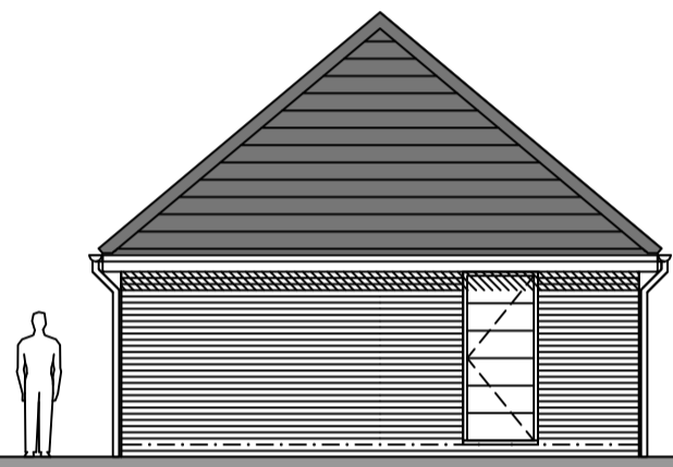
2.22 Rear Elevation