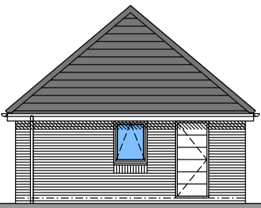
2.23 Right Hand Side Elevation