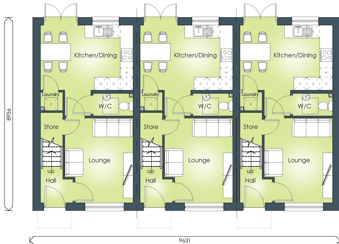
GROUND FLOOR PLAN BASED ON POBL HOUSE TYPE AUG 4800 764 4 PERSON 2 BEDROOM HOUSE TYPE