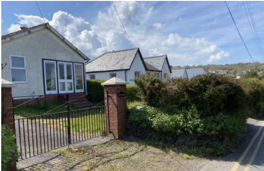
Photograph 1 – properties fronting Ffordd Newydd