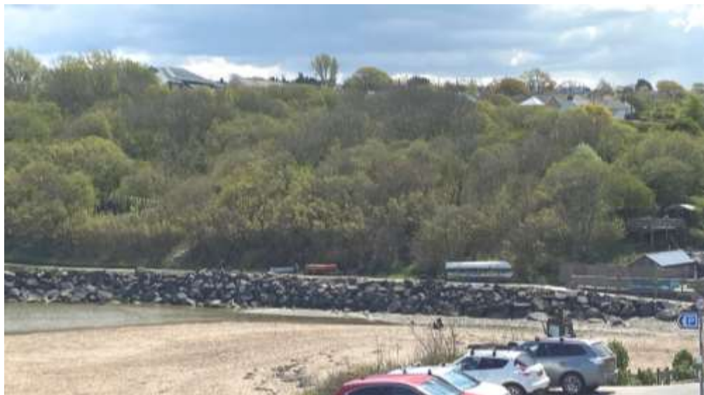
Photograph 7 – view from beach looking south to site and woodland backdrop