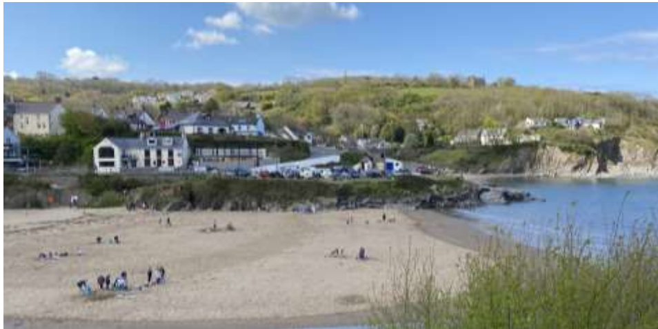
Photograph 11 – the majority of property encircling the beach are exposed to views from that foreshore or opposite sides of the Bay, whereas the application site nestles behind established woodland