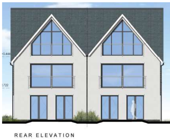
Figure 5 – semi-detached house type