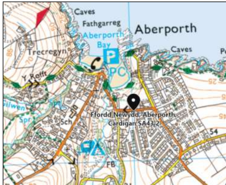
Figure 3 – OS Explorer map Extract of Aberporth

2.2.1 The submitted Location Plan illustrates the setting of the application site within Aberporth. The OS Explorer Map below gives further indication of the application site's location in terms of the surrounding area.