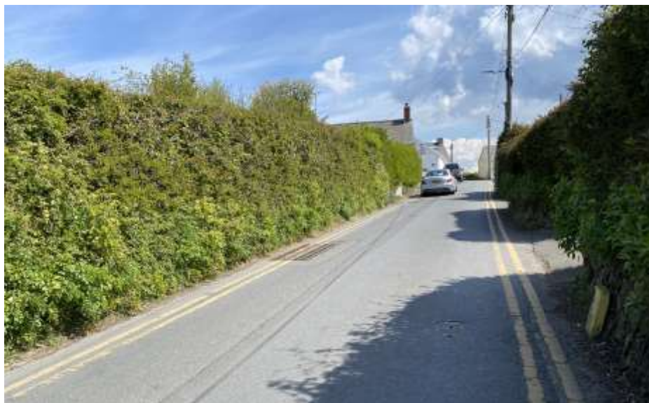
Photograph 5 – view to the east along Ffordd Newydd depicting the public carriageway