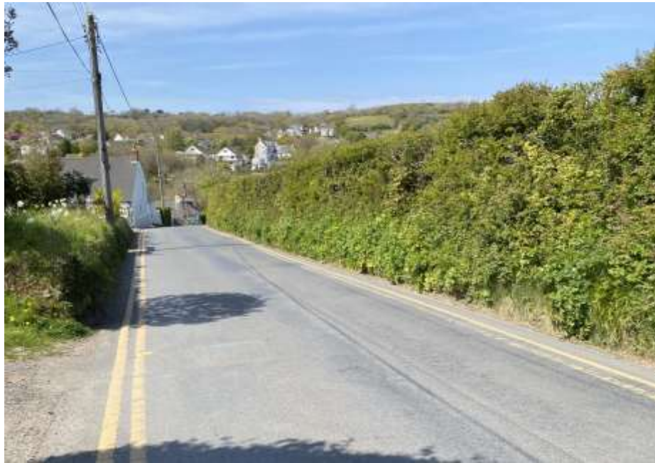
Photograph 4 – view along Ffordd Newydd looking west