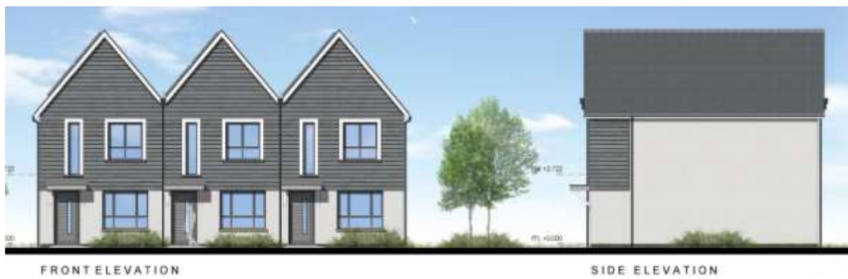
Figure 6 – Linked Affordable House Type