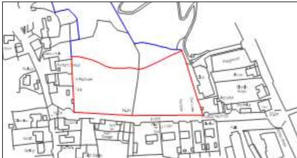
Figure 2 – Ordnance Survey Map Extract of site