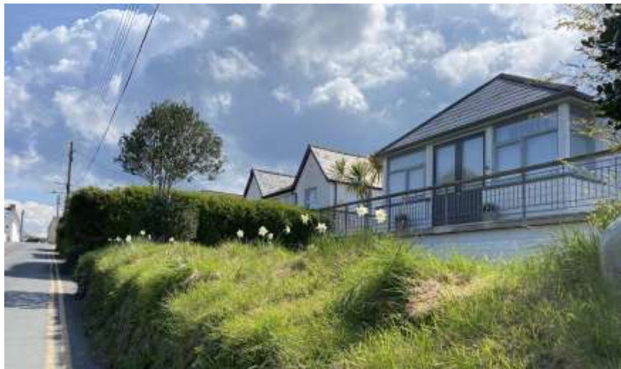
Photograph 2 – established bungalows elevated above the public carriageway