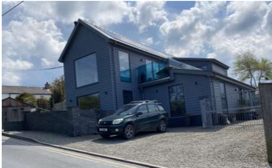
Photograph 3 – modern, recent construction at Ffordd Newydd

2.2.3 In the wider sense, the locality to the west and east of the site is primarily residential in form, whilst small commercial enterprises such as village shops, cafes and public houses are concentrated to the western side about the headland in the bay, and to the east about the junction with Banc Y Dyffryn. The site represents the only undeveloped parcel along this stretch of the B road through the village and is conspicuous as such within the above figures. However, it has no agricultural value given its small scale, nor any ecological or landscape value, as is elaborated upon with a Phase 1 Ecological Report appended to this Statement. Photographs 4, 5 and 6 below provide illustrations of the undeveloped gap set along the northern flank of the B road and the presence of an existing high hedgerow.