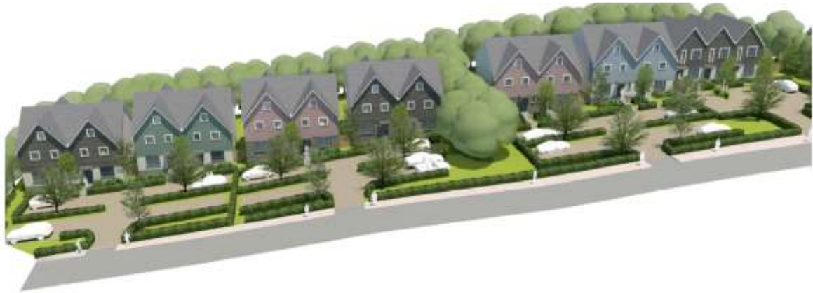
Figure 9 – Proposed Streetscene