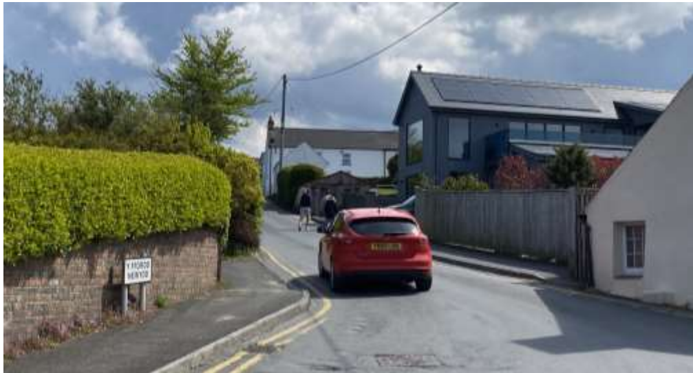
Photograph 9 – western extremity of Ffordd Newydd where the frontage of the application site is not distinguishable