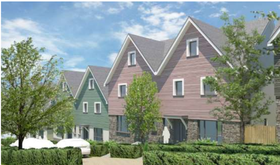
Figure 8 – Proposed Streetscene