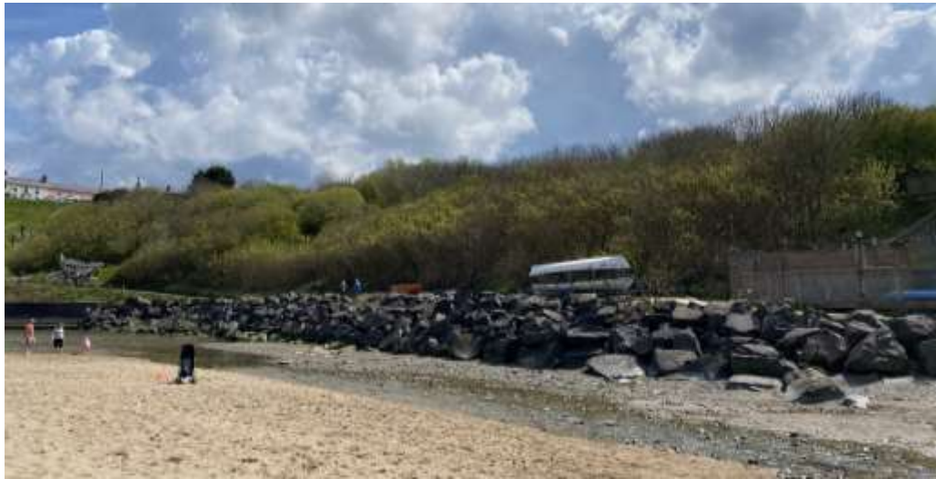
Photograph 8 – closer view of northern woodland and surfaced footpath across the sea defences which leads to informal footpaths through the woodland to the Sports Club and village centre