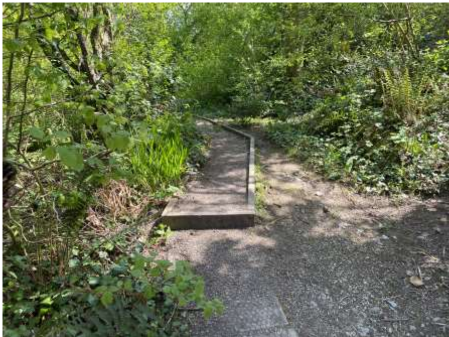
Photograph 10 – view along the informal woodland path to the north of the site, where views into the site are unachievable due to the overgrowth