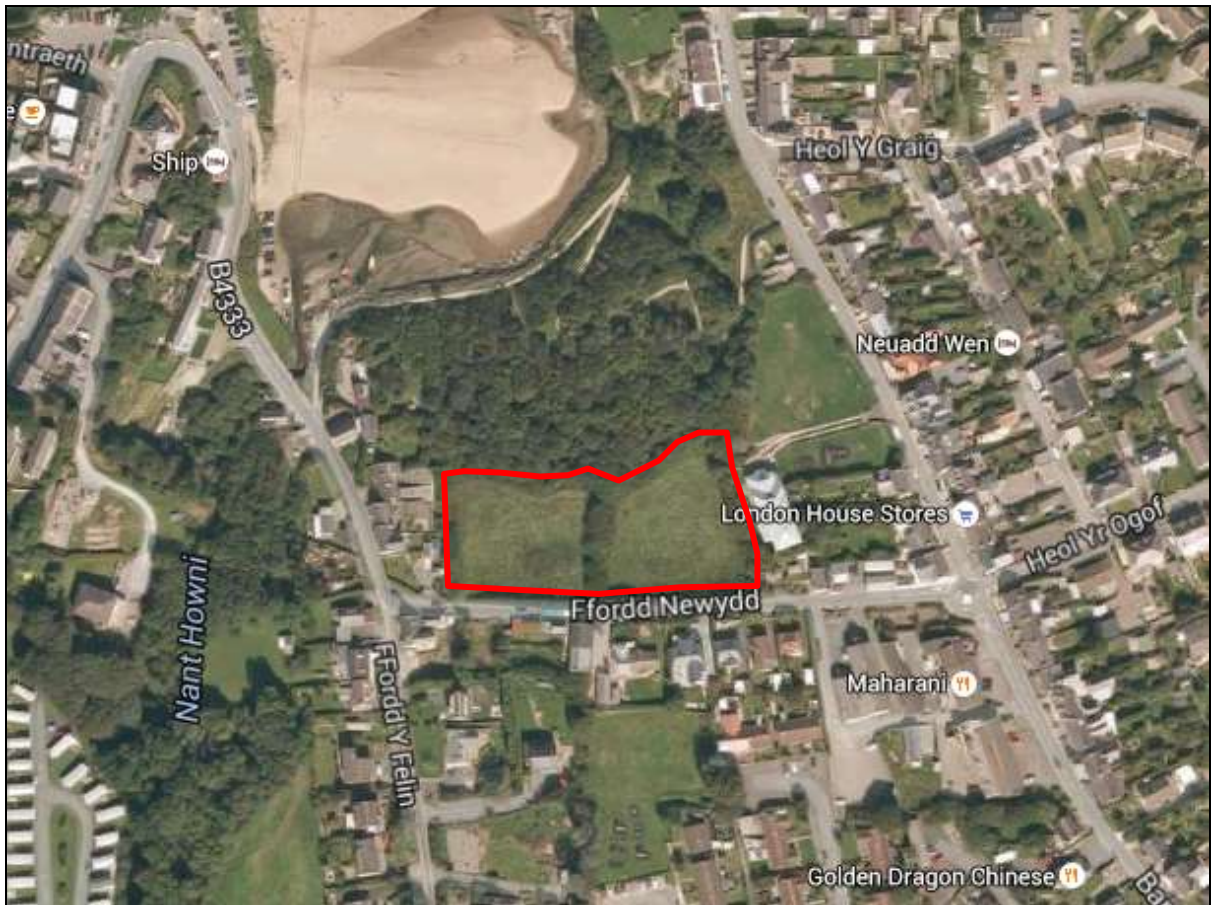
Figure 1 – Google Earth view of Application site