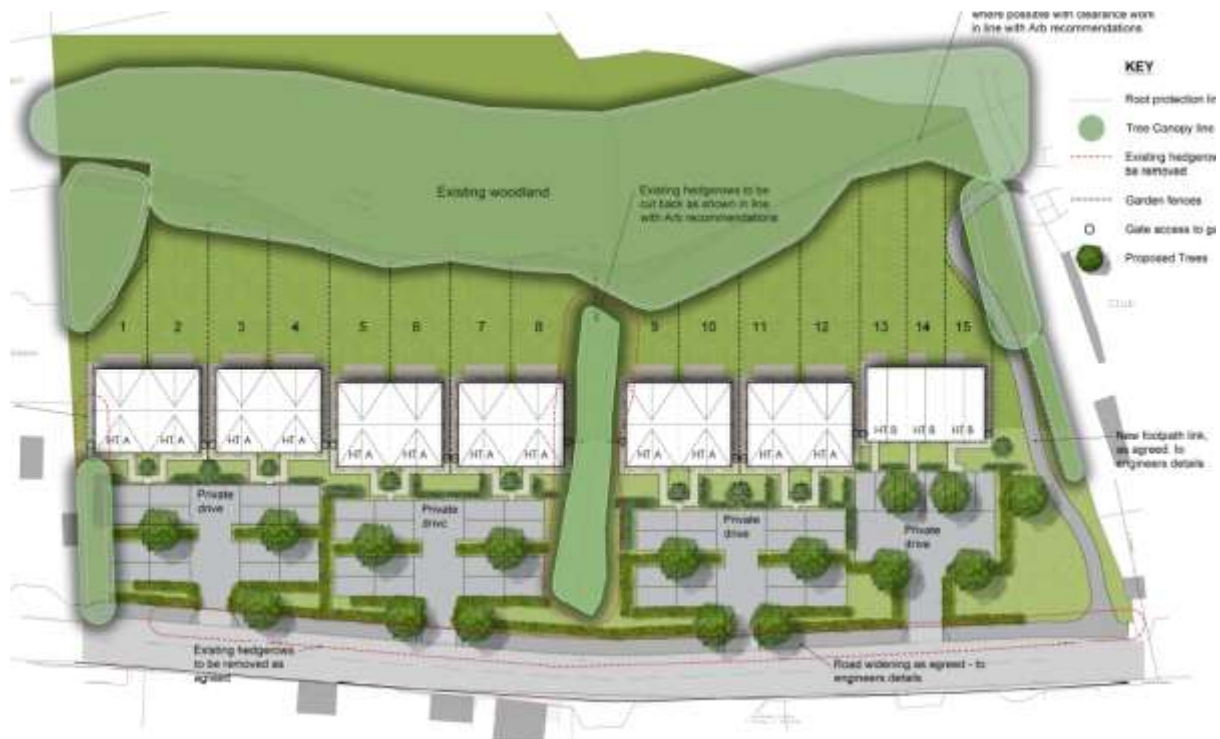
Figure 4 – Proposed site Layout Plan