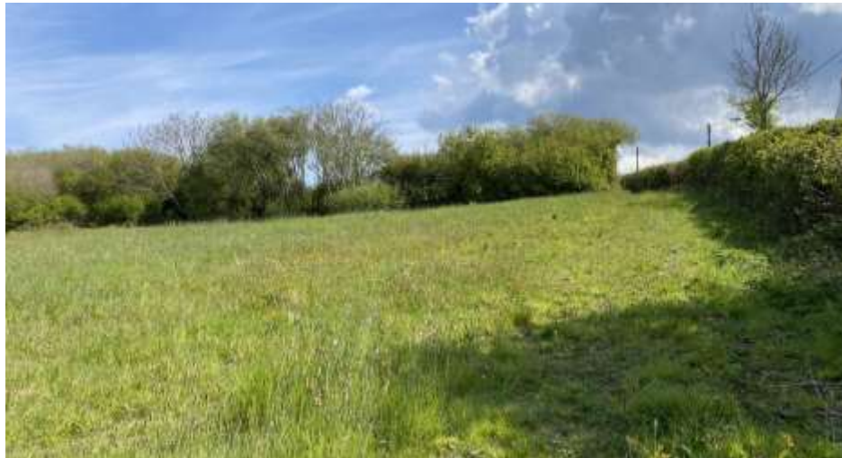
Photograph 6 – view within the application site showing the well-manage semi-improved grassland