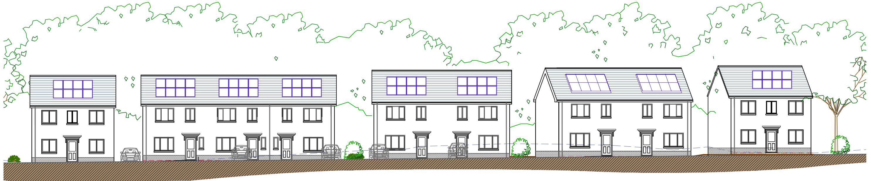
Proposed Site Elevation 1

THIS SCHEME IS SUBJECT TO LOCAL PLANNING AND ALL OTHER NECESSARY CONSENTS. ALL DIMENSIONS, SITE LEVELS AND AREAS WHERE GIVEN ARE APPROXIMATE AND SUBJECT TO SITE SURVEY UNLESS STATED OTHERWISE. ALL DIMENSIONS MUST BE CHECKED ON SITE. DO NOT SCALE OFF THIS DRAWING. THIS DRAWING IS TO BE READ IN CONJUNCTION WITH ALL RELEVANT CONSULTANTS' AND/OR SPECIALIST'S DRAWINGS OR DOCUMENTS. 'SAURO ARCHITECTURAL DESIGN' MUST BE NOTIFIED OF ANY VARIATIONS OR DISCREPANCIES BEFORE THE AFFECTED WORK COMMENCES. ALL QUERIES RELATING TO DESIGN OF FOUNDATIONS, FLOOR SLABS AND ANY OTHER STRUCTURAL ELEMENTS ARE TO BE REFERRED TO THE STRUCTURAL ENGINEER FOR CLARIFICATION.